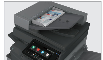
100-sheet RSPF scans documents at up-to 80 images per minute.