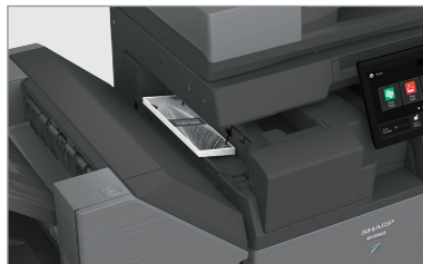
New Inner Folding Unit option offers a variety of fold patterns, including tri-fold, z-fold and others.