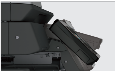
Pivoting Touchscreen offers the viewing angle for any use instantly.